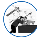
Prevention of Insider Trading