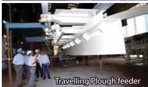
Travelling Plough feeder