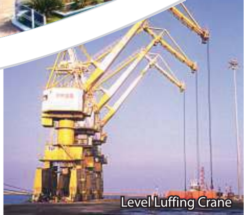
Level Luffing Crane