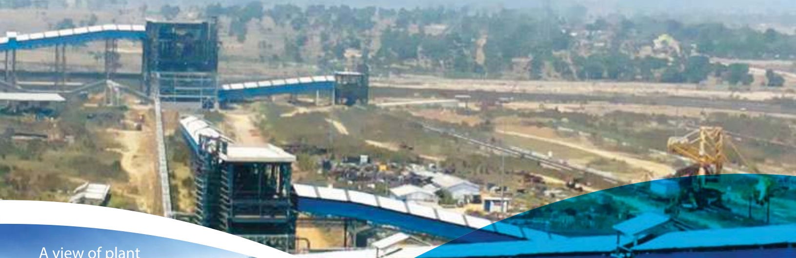
A view of plant