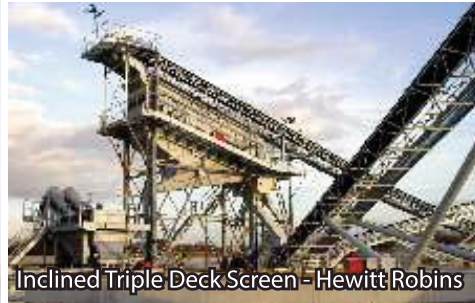
Inclined Triple Deck Screen - Hewitt Robins