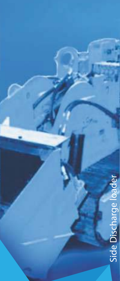
Side Discharge loader