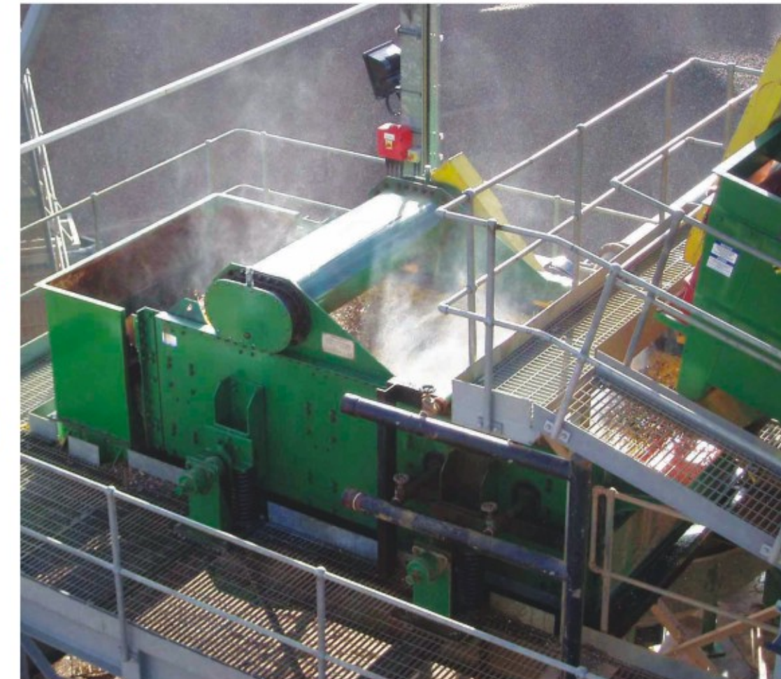
Standard Sizes – All sizes available in multi-deck